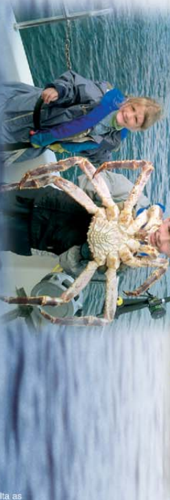
Fågtrykk Alia as